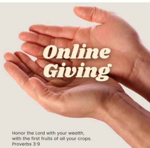
Honor the Lord with your wealth, with the first fruits of all your crops. Proverbs 3:9

With our secure Online Giving program, accessible through our website, you can set up recurring or one-time gifts, contribute to specific funds, and see your giving history at any time. Convenient for you and less processing for our office staff. Sign up for online giving today